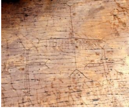
Figure 31: The three Figures which show the Four Directions in Deliklikaya

There are three figures which show the four directions in the region of Deliklikaya. The middle of them has one line. The end of the line there is an arrow sign. This arrow sign is introverted, i.e. it shows the center. At the bottom, there are sixteen lines which are connected and parallel to the line of being drawn from the middle. Eight of them are in the East, eight of them are in the West side. These figures suggest that they are a solar clock. The line which shows the South part was not completed at the part of the arrow sign. The line was lengthened at the bottom of the rock and a thought was given as infinity. In fact, the meanings of them have not been solved yet.