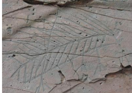
Figure 5: Animal Figure in Salihler Village Rock Art Site