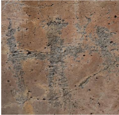
Figure 6: Animal Figure in Salihler Village Rock Art Site

c. Plant: Sometimes a tree, sometimes a branch of a tree and also sometimes a flower. Various pictures of plants may be encountered.