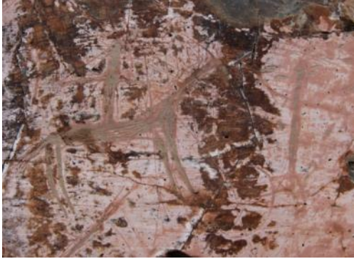
Figure 4: Animal Figure in Salihler Village Rock Art Site