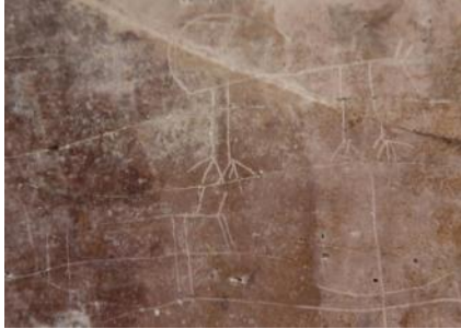
Figure 13: The Wolf Figure in the slot of Deliklikaya in the Salihler Village.