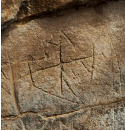
Figure 28: The Figure Which Shows the Four Directions in Yandaklıdere

We also come across with some elements about the sky and the earth in the field of petroglyphs in the Salihler village. Each one of these have linked with the Turkish history and their fatherlands. In the field of Yandaklıdere petroglyphs, the signs which show the directions were drawn in some circles. The sign of directions in Deliklikaya are not drawn with some lines around them. The figures which are about the sky and the earth that are found in Yandaklıdere and Deliklikaya are as follows: