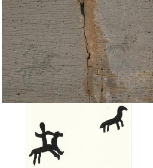
Figure 21: The Man with Falcon and a Hunting Dog which is located on the field of Rock Pictures and the Inscriptions in the Salihler Village Esatlı Town

One of the pictures and figures on the rock inscriptions which is found in the beginning on the Salihler village is the Man with a Falcon. This figure is about the hunt and hunting.