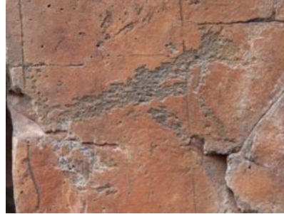
Figure 14: The Wolf figure in the slot of Yıkılankaya in the Salihler Village (Photographed by: Necati Demir).