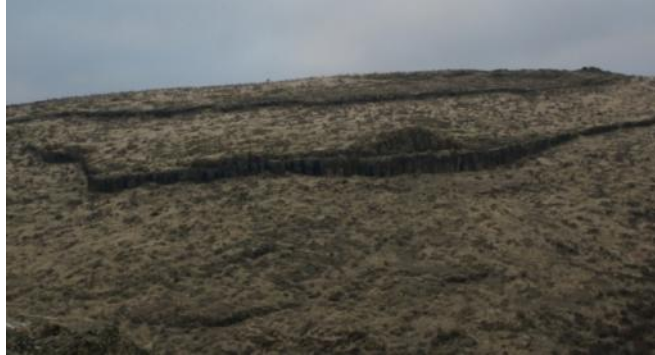
Figure 1: One of the five areas which are found Rock Pictures and Inscriptions in Salihli: Asmalıyatak (The Pictures and inscriptions are mainly on the rocky ledge which are at the middle of the photograph.)

There are hundreds of pictures and figures, a few of inscriptions at the southern parts of the rocks which are found in Salihler village. In this study we will only focus on the pictures and figures.