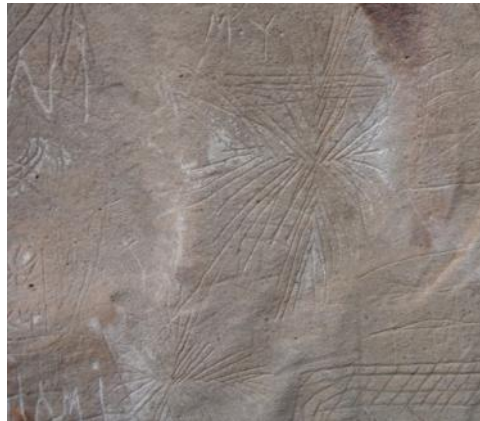
Figure 20: The Sun with The Moon which is in the field of rock pictures in Esatlı

In Turkey, the figures of moon and sun are also found between the figures of rock pictures and figures in Ordu-Mesudiye the village of Esatlı (Demir, 2009b, p. 3-30)