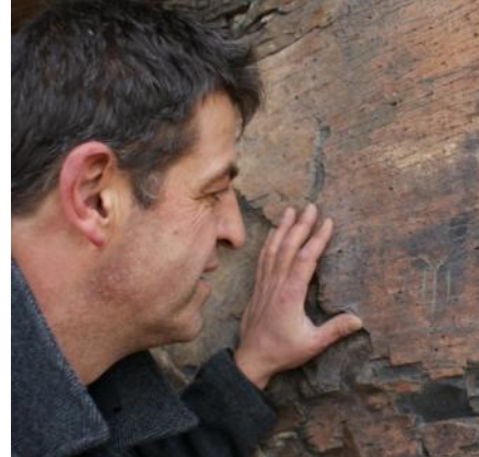
Figure 11: Mark of the Kayı Clan that established Ottoman Empire.

g. Some elements about outer space and earth since: There are some attractive figures about guidance and direction signs. Some elements about primitive calenders and time measuring elements are also encountered on the rocks.