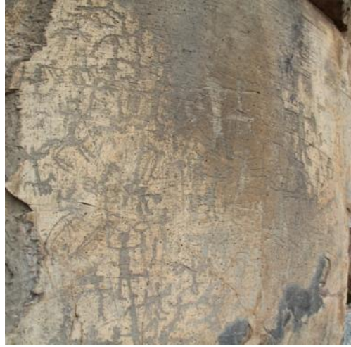
Figure 3: Human figures at Salihler Village Rock Art Area

The humans appear sometimes hunting, sacrificing a victim, sometimes praying, and sometimes breeding. Pictures and figures reflect the status of the society that are living with hunting and supporting themselves with animal husbandry. It could not be identified that they laboured with agriculture. It is noteworthy that some human figures with the head of them in sun, moon and star. These figures which are the common values of the Turkish world make Salihler village significant.