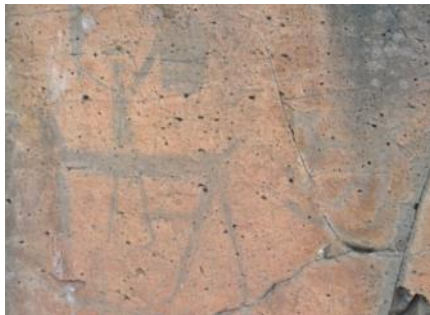
Figure 26: The Rock Pictures and