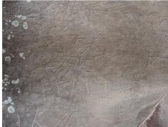
Figure 22: The Man with Falcon on The Rock Pictures and Inscriptions which is located in Esatlı

Almost the same figure is found on the field of rock pictures and inscriptions in the Ordu Esatlı village (Demir, 2009b, p. 3-30):