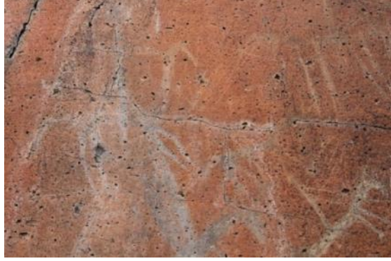
Figure 23: The Horses and Hunting Rock Pictures and Figures in the field Salihler Village

One of the most noteworthy rock pictures which is found in the Salihler village is the stages about horse and hunting. The four ones that we think they are important are as follows: