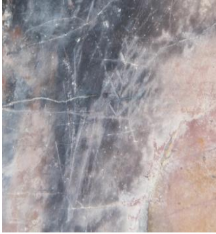
Figure 7: Plant figures at Salihler Village Rock Art Site