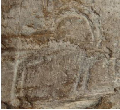
Figure 16: A Goat Figure which is located on the Field of Rock Pictures and Figures in the Slot of Yandaklıdere in the Salihler Village