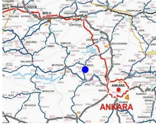
Map 1: Ankara City, Güdül Town

It is also identified that there are some old settlements and some old graves that were in Turkish grave style at the nearest parts of the regions of rock pictures and inscriptions. These places await the attention of some scientists who are making some studies about old settlement places and kurgan (tumuli).