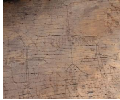
Figure 32: The three Figures which show the Four Directions in Deliklikaya

In Deliklikaya region, the other figure which shows the four directions are smaller than the figure in the middle. The figure at the left part was shaped like one of them is on the middle and the others are at the edges of it. The arrows which are at the end are in inward position and point the center. The figure at the right part was shaped with the two lines. The sign of the arrows are outward position. Only the ones which are faced to the West and