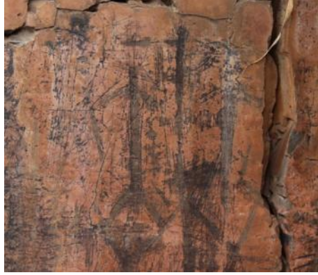
Figure 12: Figures in Salihler Rock Art Site.

One of the hints about the period are the contents of the pictures. There is not a single point about making agriculture of the society. Thus, the society that made these pictures was a society that made their living by hunting. This situation leads us again to the early years of Christ. Hunting lost its importance after turned into entertainment. Therefore, it was given up beseting on the rocks as an important event.