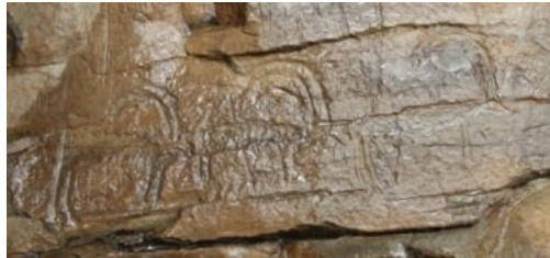
Figure 15: A Goat Figure which is located on the Field of Rock Pictures and Figures in the Slot of Yandaklıdere in the Salihler Village

One of the most marked figures of the rock pictures, figures, marks and inscriptions which are found in the slot of Yandaklıkaya in the village of Salihler is goat. The appearances of three goats which are walking in a row give someone pause to think that it is a sacrificial ceremony. Forasmuch as; we know that for closing the violence and wrath, Turks sacrifices a victim in order to make a wish to God, to be purified from their sins, to repent (Demir, 2010, p. 5-23). The overview of the goats as follows: