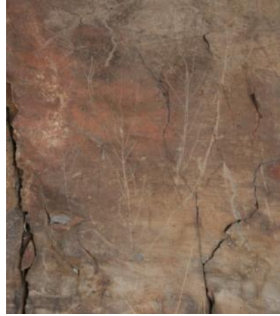
Figure 8: Plant figures at Salihler Village Rock Art Site

d. Tools and equipments: arrow, bow, bayonet, sword, knife, eating utensils, religious and casual clothes, clothings, banner, flag.