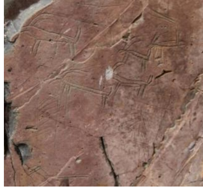
Figure 17: Goat Figures in the Salihler Village