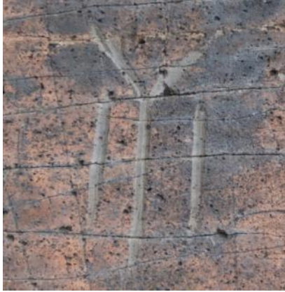
Figure 10: Mark of the Kayı Clan that established Ottoman Empire.

f. Marks: Within the petroglyphs of Salihli village three pieces of marks were ascertained which belong to Kayı clan that established the Ottoman Empire. In addition to that, there are also the marks of Bayat, Yazır, Avşar, Begdili, Karkın, Peçenek, Çavundur and Salur clans. Otherwise, it appears some unidentified marks.