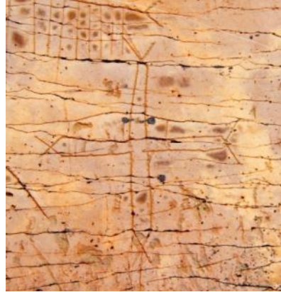
Figure 34: The Figure Which is Show the Four Directions in Deliklikaya

In the Kabahöyük region which is at the Nourth-west of the Salihler village, there are two figures which show the directions.