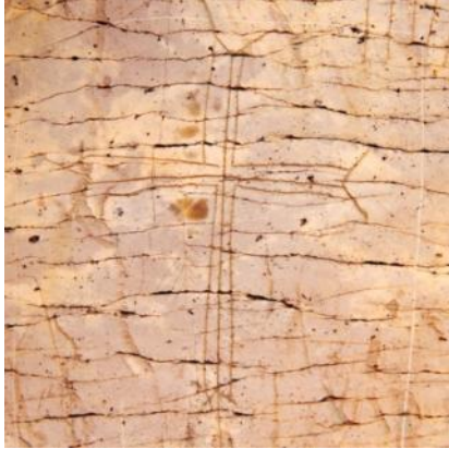
Figure 33: The Figure Which is Show the Four Directions in Deliklikaya

the South, cross(x) sign was put. It means if it is not carelessness, these points were pointed out either the inner part or the out part. At the southern end of both figures were not finished at the end of the arrow are lengthened at the bottom part of the rock. By this drawing a thought which is about eternity must be given.