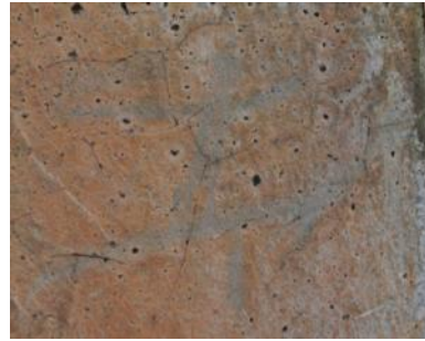
Figure 25: The Rock Pictures and figures of Horses and Hunting in the field Salihler Village