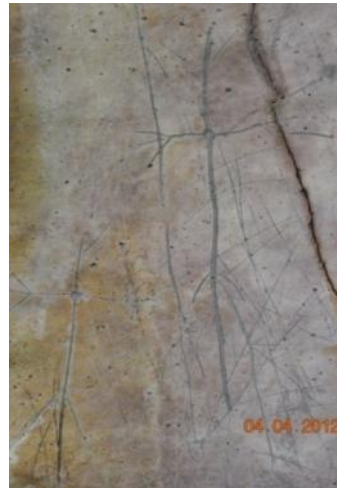
Figure 36: The Figure Which shows the Four Directions in Kabahöyük.