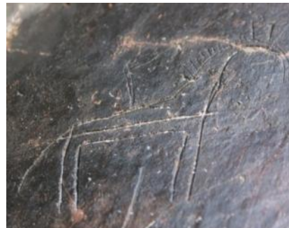
Figure 27: The Rock Picture of Horse