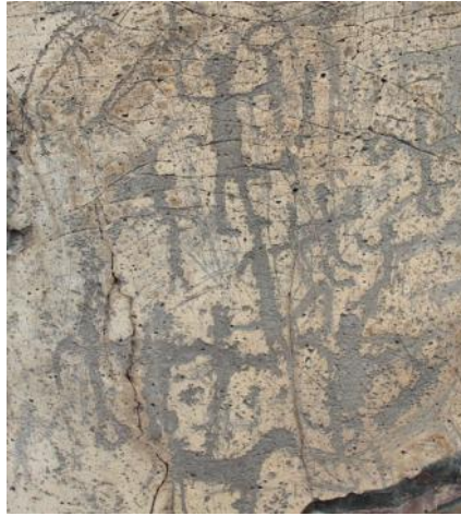
Figure 9: Tools and Equipment Figures.

d. Tools and equipments: arrow, bow, bayonet, sword, knife, eating utensils, religious and casual clothes, clothings, banner, flag.