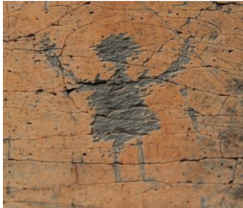
Figure 2: Human figure at Salihler Village Rock Art Area

a. Human: The human in the fields of petroglyphs is always breezy in Salihler village. Its appearance is dynamic, straighten up, haughty and brave. The pictures and figures appear as man and woman. It could be immediately understood if it is man or woman with the structure of its chest, the structure of its thin or thick waist. They are often hanged out armed and on a horseback, sometimes fighting scenes, sometimes walking of a human.