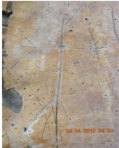
Figure 35: The Figure Which shows the Four Directions in Kabahöyük.

In the Kabahöyük region which is at the Nourth-west of the Salihler village, there are two figures which show the directions.