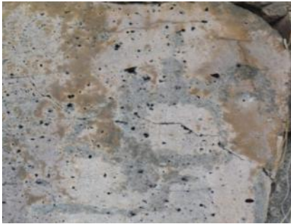
Figure 24: The Horses and Hunting Rock Pictures and Figures in the field Salihler Village