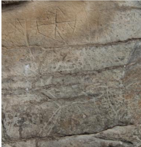
Figure 18: The Deer Figure which is located in the area of the Salihler village.

One of the most important figures between the petroglyphs in the Salihler village are goats. It takes a place between the rock pictures in the Yandaklıdere slot. The high horns, even bigger than the size of a deer is attracting the attention.