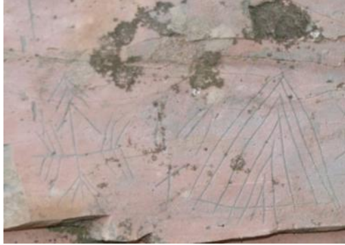
Figure 30: The Figure Which Shows the Four Directions in Asmalıyatak Region.

There are three figures which show the four directions in the region of Deliklikaya. The middle of them has one line. The end of the line there is an arrow sign. This arrow sign is introverted, i.e. it shows the center. At the bottom, there are sixteen lines which are connected and parallel to the line of being drawn from the middle. Eight of them are in the East, eight of them are in the West side. These figures suggest that they are a solar clock. The line which shows the South part was not completed at the part of the arrow sign. The line was lengthened at the bottom of the rock and a thought was given as infinity. In fact, the meanings of them have not been solved yet.