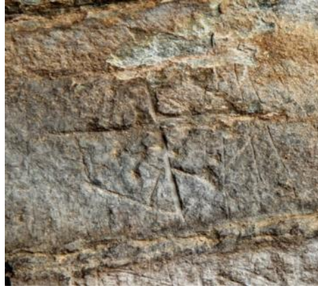
Figure 29: The Figure Which Shows the Four Directions in Yandaklıdere

The figure which shows the four directions are different from the others in the region of Asmalıyatak. The sign arrows at the end of the line on the South are two, on the other line are three. The direction of the arrows, except the North, are introverted. The direction of the arrow which is on the North is extraverted.